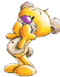
tafel van 5