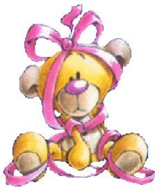
tafel van 3